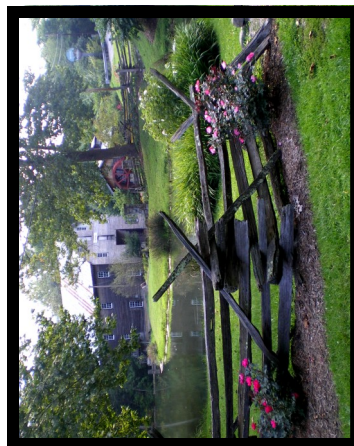
Cook's Mill Greenville, WV