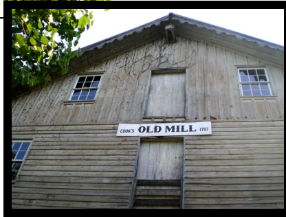
Cook's Old Mill Greenville, WV Running by 1797

Fundraising Campaign An annual Fundraising Campaign is being developed by a new Historical society committee. As we strive to protect and preserve Monroe County's extensive archival collections and artifacts, the costs of utilities, insurance and building upkeep put a financial strain on society resources. Financial support from a Greater Greenbrier Valley Community Foundation grant will help cover immediate fundraising costs such as printing and postage. More details will be forthcoming later in Fall 2009.