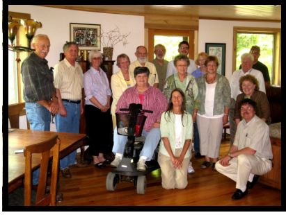
MCHS Welcoming Pounding Party – 2010

Writing this on my last official day working as a VISTA, I look around, not only the museum but also all of Union with a lot of fondness.. A year ago, I moved to West Virginia without knowing a single person or ever having been here before. Now that I'm at the end of my term, I wish I could stay.