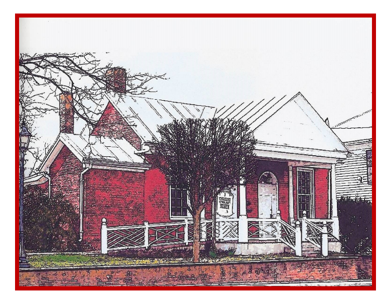
P.O. Box 465 Union, West Virginia 24983