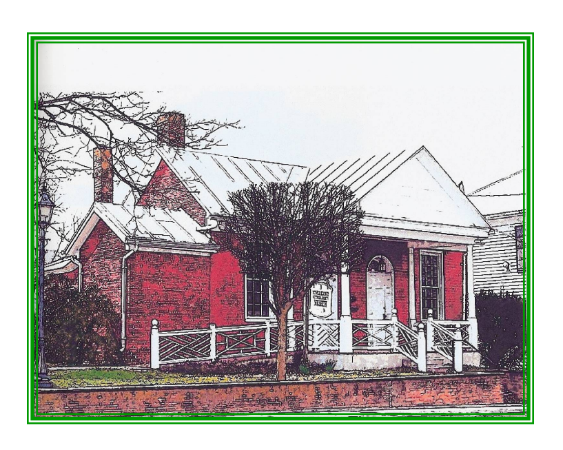
P.O. Box 465 Union, West Virginia 24983