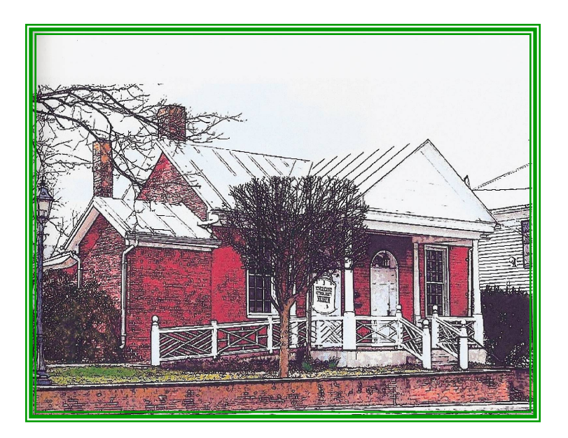
P.O. Box 465 Union, West Virginia 24983